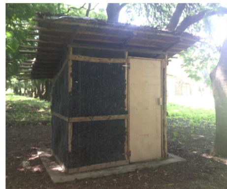
Figure 1. Evaporative cooling structure.