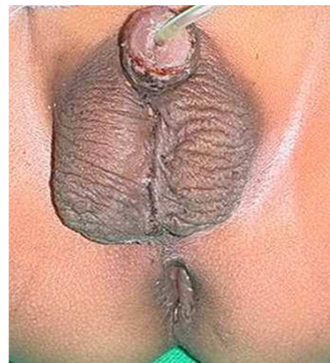
Figure 3. Posturethroplasty and hypospadias repair photo.

The patient got good bowel and bladder voiding functions on follow up after 3 months.