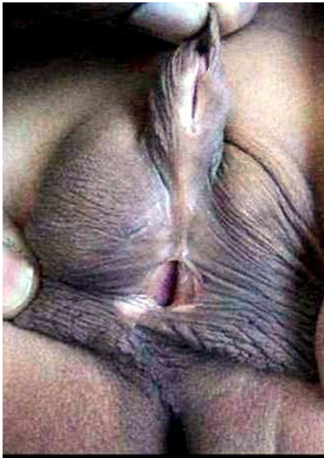
Figure 1. Skin lined anus placed within bifid scrotum, sub coronal hypospadias, thin ventral urethral wall, thin perineal body.

dilator. Both testes were palpable within scrotum. Patient had subcoronal hypospadias, minor chordee, ventral urethral wall was hypoplastic and thin. All sacral vertebrae were palpable. Rest of spine was normal. Systemic examination was normal. Baby was worked up for various associated congenital anomalies. Ultrasound (USG) abdomen showed non-visualization of right kidney, left kidney was normal. This was confirmed by CT scan. A 2-Dimensional echo study of the heart was normal. Micturating cystourethrogram showed good bladder capacity, smooth mucosa, no vesicoureteral reflux, and no evidence of any fistula. Parents were given detailed information about the possible diagnosis and were counseled regarding staged correction of rectoperineal fistula and associated hypospadias. Since baby was defecating well through anteriorly displaced ectopic anus definitive surgery was planned, by taking the informed consent of the parents, after baby was above 3 kg. Patient was kept on weekly follow-up visits to the outpatient department. On gaining the weight, patient was admitted. His routine blood investigations were done along with fitness for anesthesia. Patient was kept nil by mouth before 12 hours before the operative procedure. Anal wash was given along with enema a day before the surgery and repeated on the morning of the surgery.